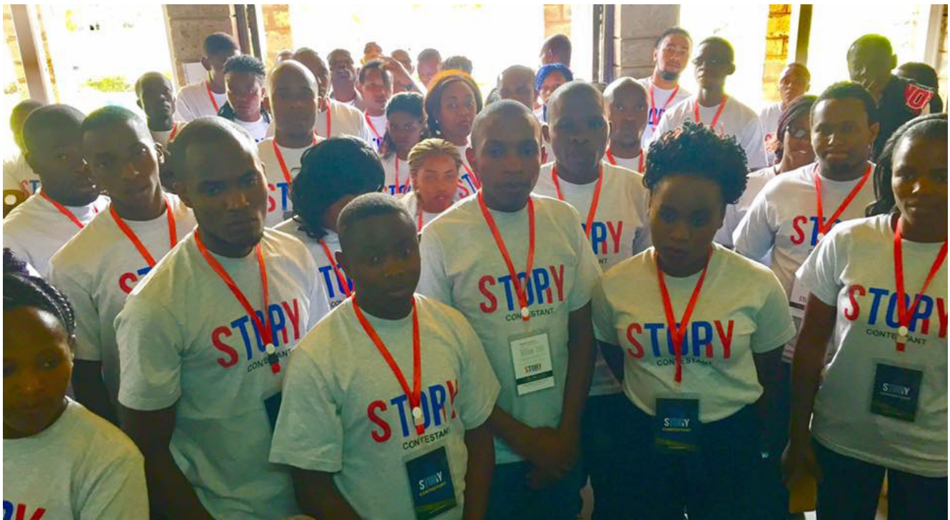
Top Story Student Teams in Kenya.

In Senegal EJC continued its work with Dakar-based journalism school E-jicom, with regional independent news service Ouestafnews and with Africa Check (Francophone). An investigative journalism fund was launched in 2018, featuring an international jury, with the first eight awarded projects mainly focused on local corruption. A small investigative grants programme was expanded for E-jicom journalism trainees for distribution via Ouestafnews network, focused on targeting development issues and good governance. E-jicom trainees also worked directly for Africa Check (Francophone) consistently contributing throughout 2018 to their regular Bulletins that push back on fake news and disinformation.