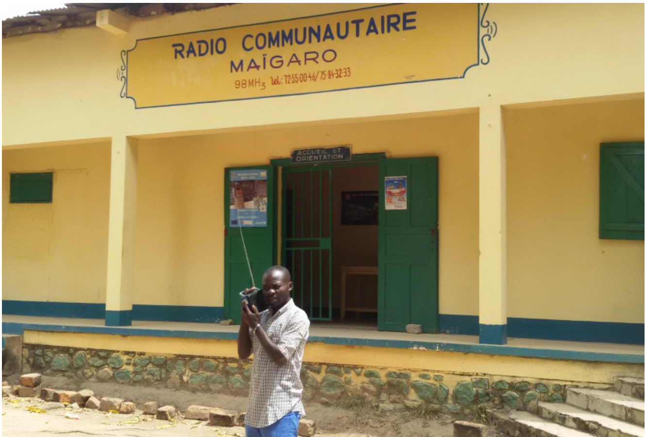
Radio Maïgaro in Bouar, Central Africa Republic.

news website, with a training in mobile reporting and storytelling, a mobile news app, and with institutional support.