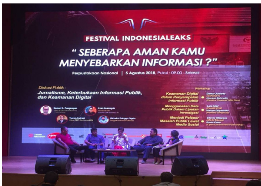
IndonesiaLeaks Festival with a public debate on the topic of 'Journalism, Public Information Access and the Digital Age'.

In the meantime, 7 high impact stories produced by the fellows from the Investigative Fellowship initiated by Tempo Institute were published in 2018. The fellows are using the Public Information Disclosure Act (RTI) for their investigations on topics like human trafficking, illegal mining & logging, environmental pollution, marihuana production and distribution, civil servants corruption. They work closely with a range of national and local CSOs/NGOs (>20) to gather information.