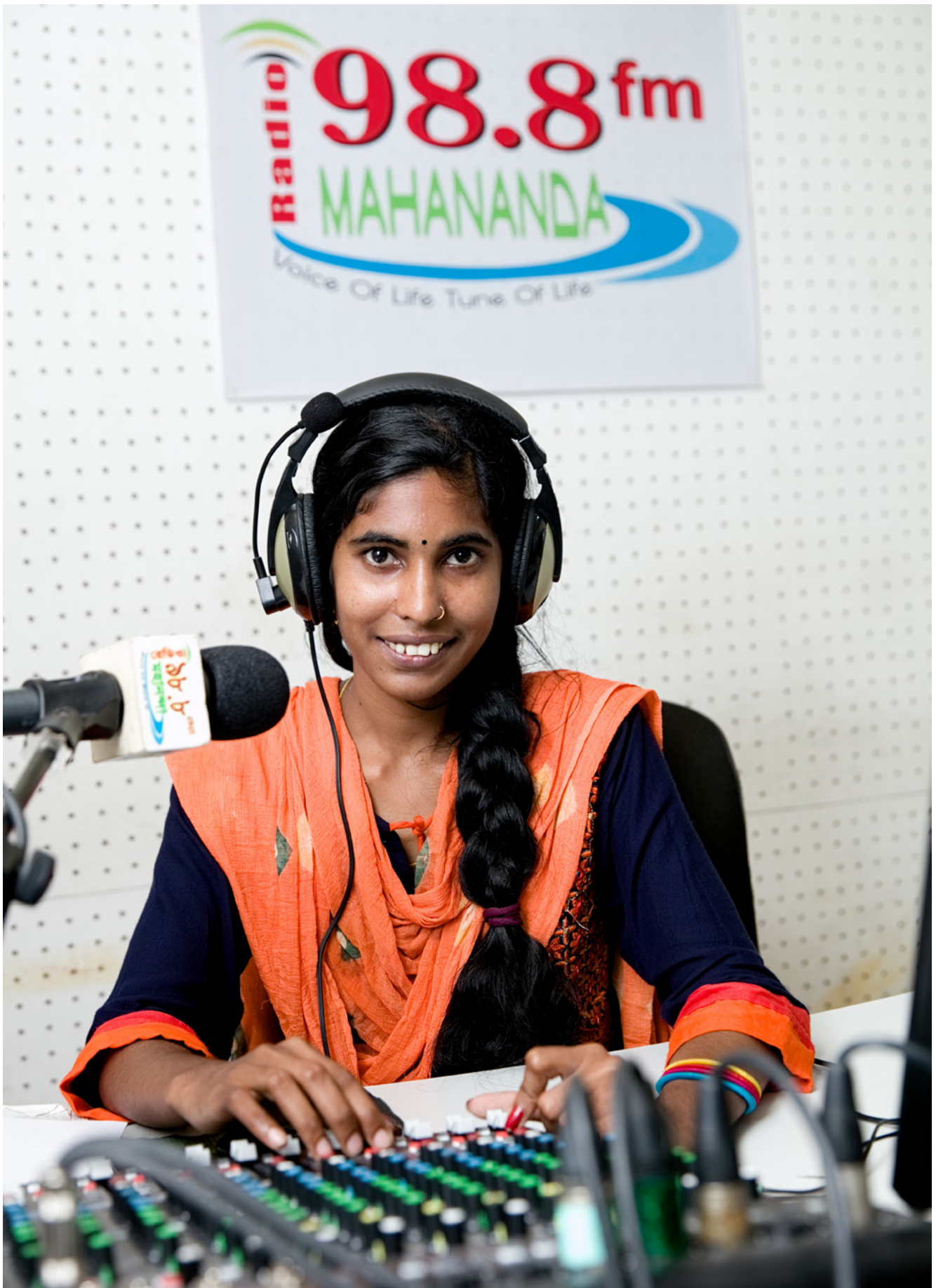
Live broadcast by Radio MAHANANDA 98.8 fm; Chapainawabgonj District, Bangladesh.