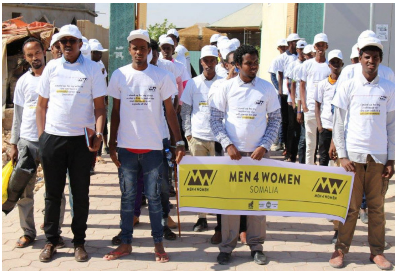
Men 4 Women campaign March 8th, 2018 in Puntland.

In Somalia, SOLJA organised a "Women in Media Conference" in March 8th, 2018. In Puntland, MAP organised the Men4Women March on the same day (see picture below).