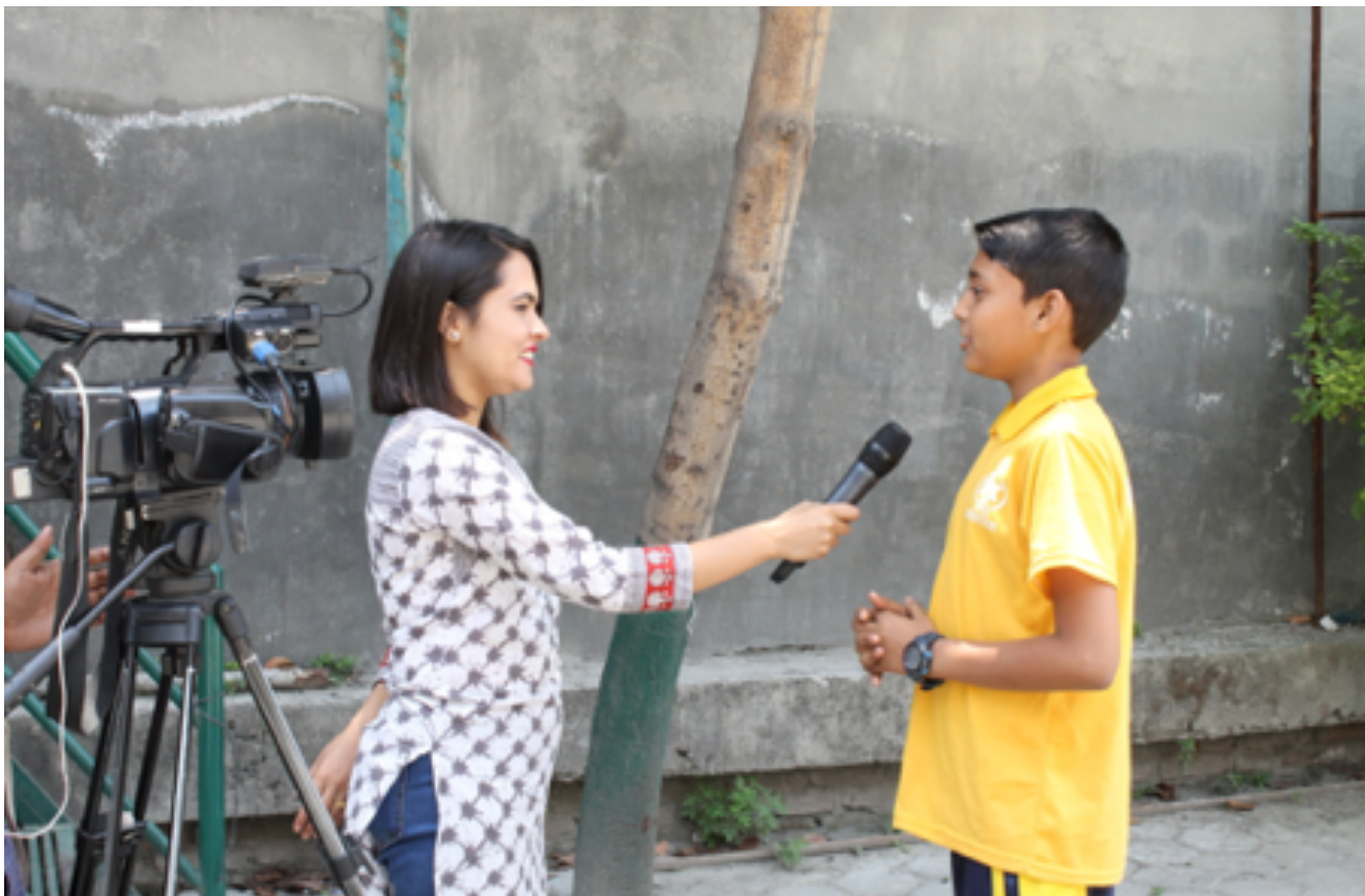
School screening NayaPusta in Kathmandu.

The in 2017 produced investigative stories on human trafficking from Nusa Tenggara to Malaysia, a joint collaboration with Malaysia Kini, resulted in bringing one of the perpetrators to justice. The Editor in Chief of The Reporter, from Taiwan, said that the results of the coverage had encouraged the Taiwanese government to improve regulations regarding the system of contracts and protection of workers on their fishing vessels. Ground-breaking cooperation with Kompas newspaper (a competitor of Tempo) in follow-up to a story about a cover-up of illegal logging in Papua, resulted in measures taken by the Ministry of Environment.