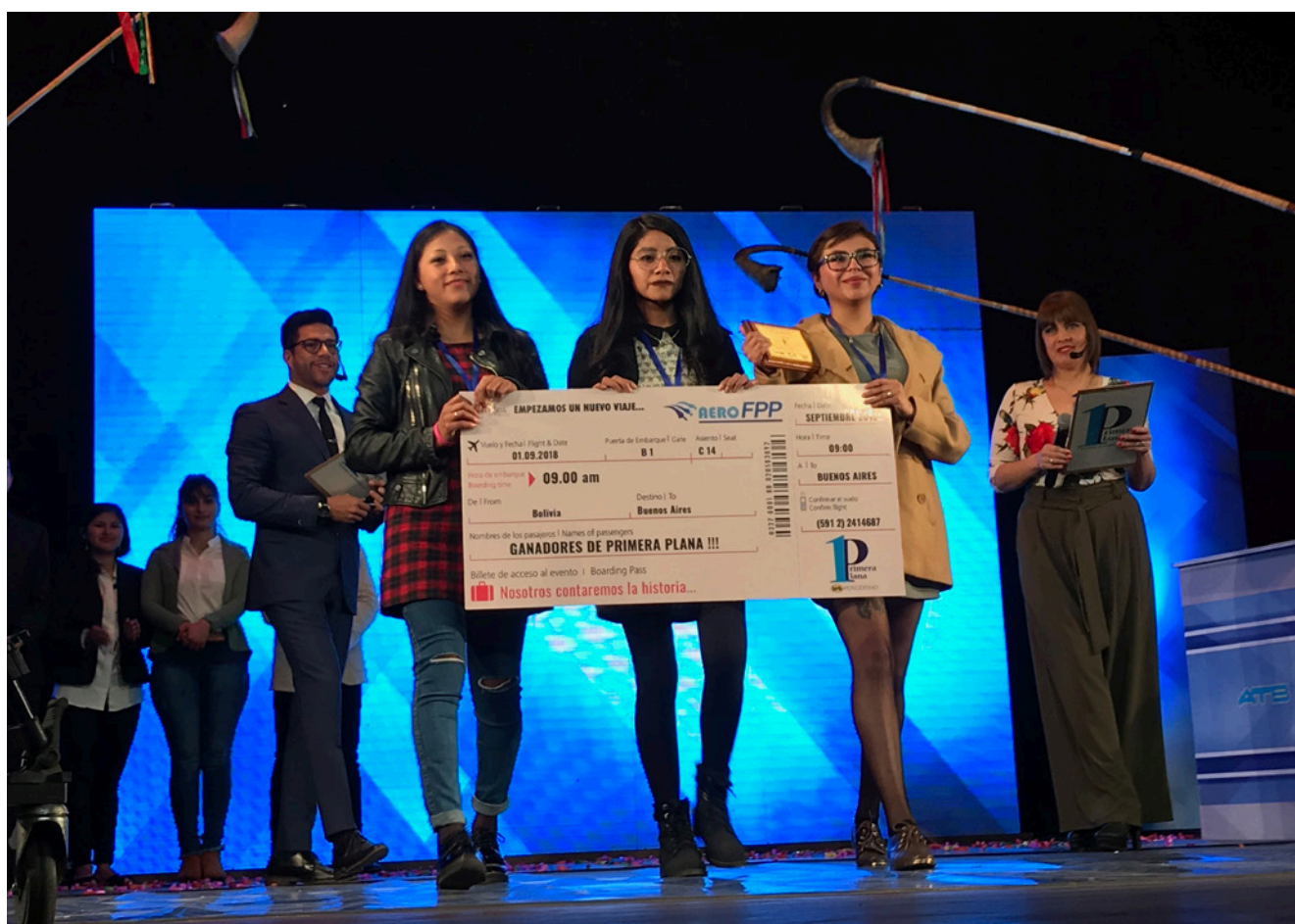
Primera Plana winners 2018.

To make journalists more aware on how their audiences engage with their productions, a workshop was organised by FPU during the FOROCAP (Central American Journalism Forum) in which journalists were put back in the audience's shoes. 18 journalists from the region participated in this and have increased their capacity to produce more audience-engaging pieces. All partners have improved their connection and interaction with their audience, although there is still room for improvement. As strong examples, live video-chats from Nómada show how they maintain contact with their audience, explaining complex political developments in easy-to-understand language, and also to answer live questions about this. Partners also now use Instagram stories with infographics as a way to update their younger audience on the daily news and have interaction with them using social media channels that are frequently used by specifically that audience, and preferred over traditional articles/TV shows.