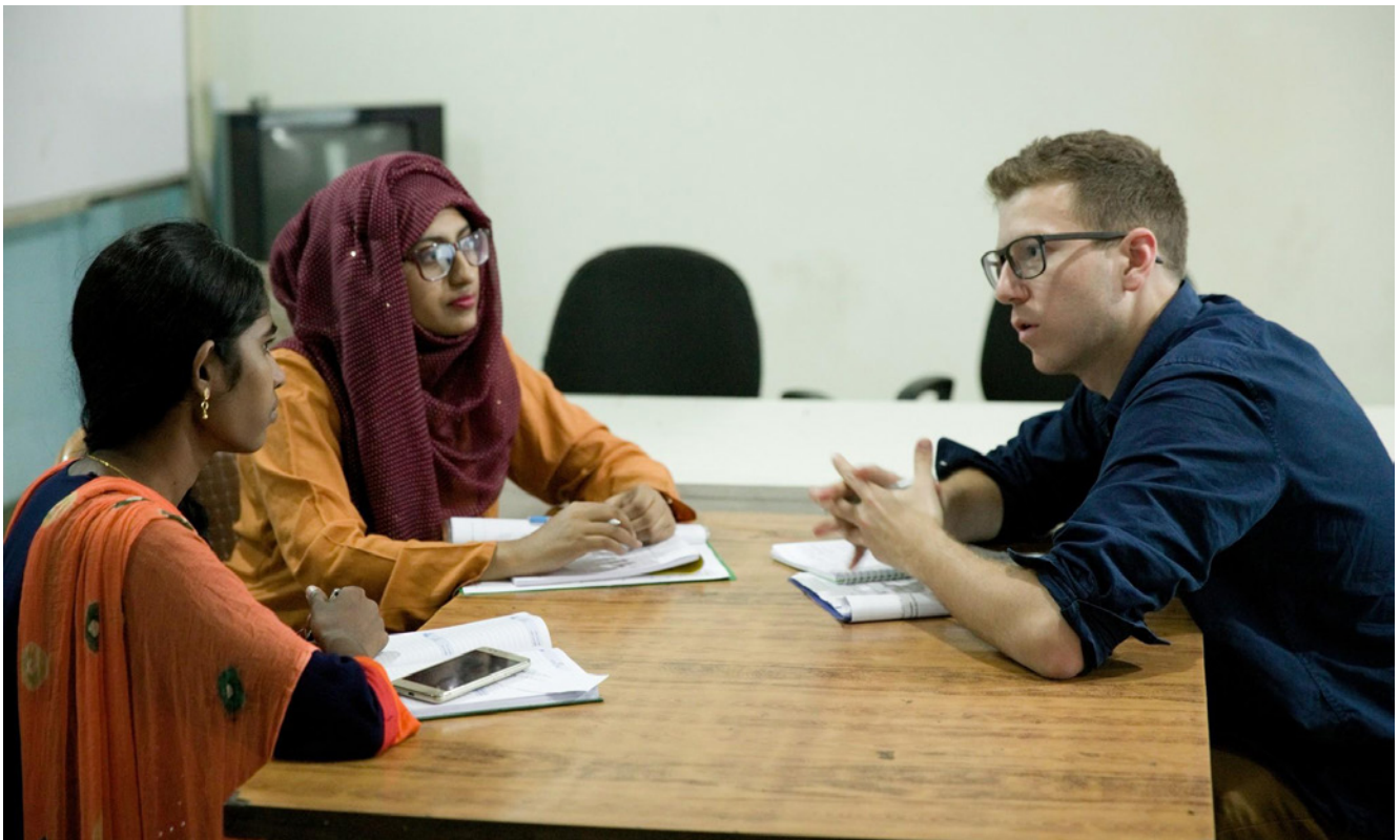
Most Significant Change interviews by FPU in Bangladesh.

The Midterm Review gives a good idea of what works and what doesn't, but also gives us new questions. Does more gender equality in the media automatically lead to content that does more justice to women? Is educating