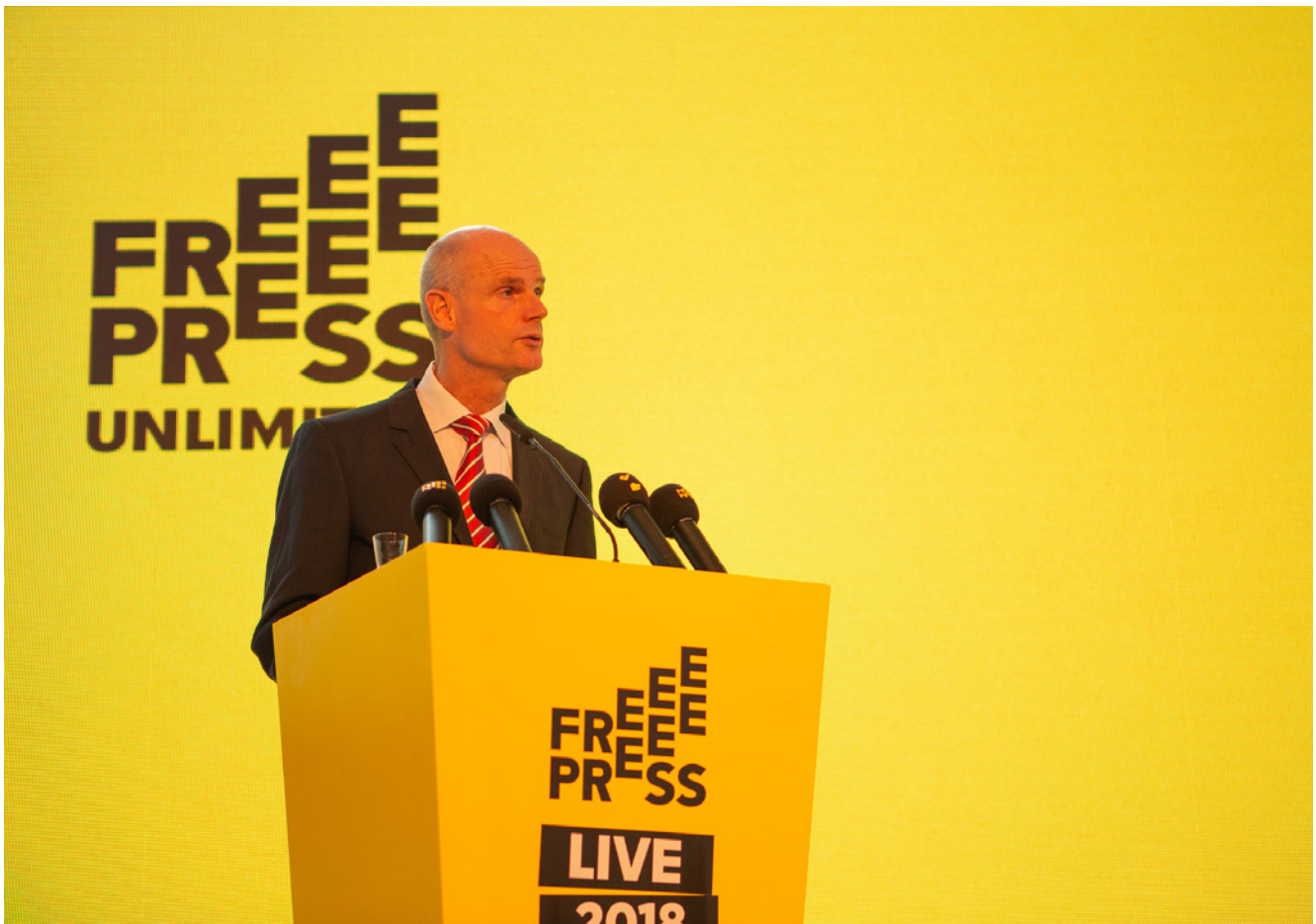
The annual Free Press Live event, held on the International Day to End Impunity for Violence Against Journalist.

citizen journalists the best way of providing news to media-impoveryed and under-represented groups? And which business models are in fact the most effective for various media in conflict areas? These questions were included in a research agenda for 2019 and 2020.