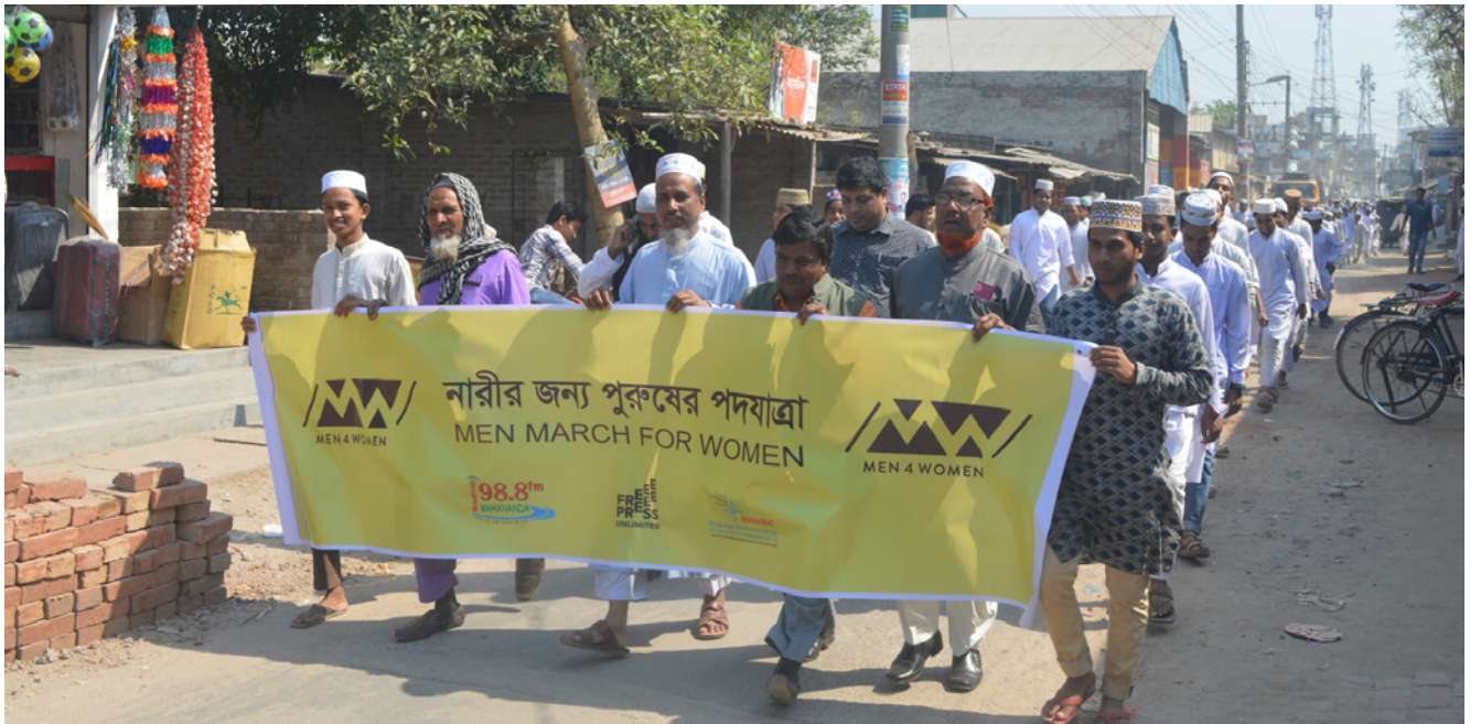
Men 4 Women campaign March 8th, 2018 in Bangladesh.

school students can identify propaganda out of media messages, are able to differentiate reality from media-created facts and can search Internet for various sorts of information more effectively. SACMID also organized important round table discussions engaging different actors. As a result, media literacy became an important topic for various stakeholders - from educators to government officials, international development organisations, parents and students. SACMID's expertise is requested frequently by organisations and educational institutions and has succeeded to draw the attention to media literacy as an emerging and urgent issue in the media landscape of Bangladesh.